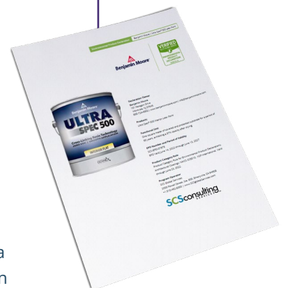
EPD for Benjamin Moore® Paints

EPDs must be published and publicly listed on a recognized EPD program.