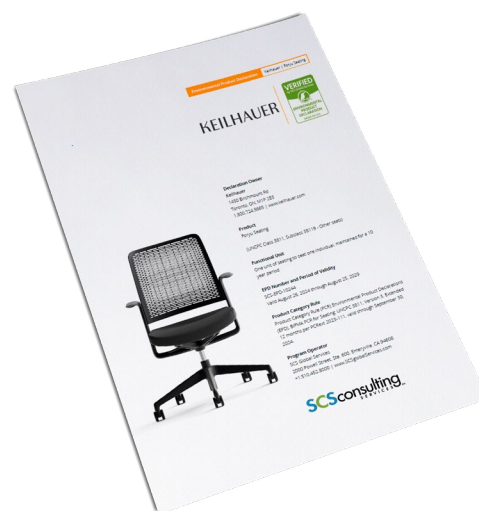
EPD for Keilhauer Chairs

Products with existing EPDs undergoing renewal or products included in industry-wide EPDs, have the opportunity to demonstrate improvement in environmental impacts and contribute to an additional credit in LEED v4.1 and v5 for EPD Optimization. SCS will prepare an Optimization Report based on the new LCA comparing the impacts to the old EPD or industry-wide EPD. If a new product EPD demonstrates improvement in greenhouse gas warming potential (required) over the comparison EPD, it can contribute to the additional credit.